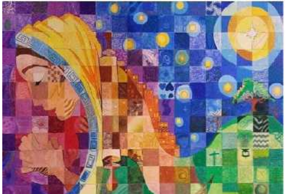
Mosaic by members of Christ City Church Memphis, TN

Micah 5: 1-4a Psalm 80 Hebrews 10: 5-10 Gospel: Luke 1: 39-45